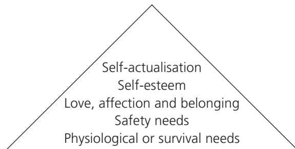
Figure 8.1 Maslow's hierarchy of needs

Behaviour which helps people to interact effectively, such as reconciling disagreements, praising, encouraging, co-operating and listening, all contribute to successful